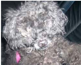
Licorice, first day of rescue