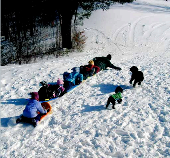
Sporting his winter fleece, Figaro frolics with friends.

Living in New England, we all have seasonal routines to prepare for colder weather. We pull out our shovels and ice melt, change our wardrobes, and ready our cars. Here are some tips for insuring our faithful companions are just as prepared for winter weather!