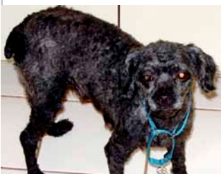
Ginger, first day of rescue.