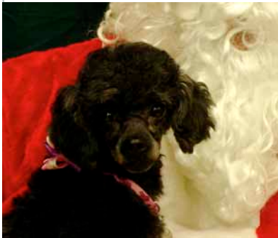
Ginger and Santa