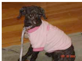
Ginger, resplendent in her new coat.