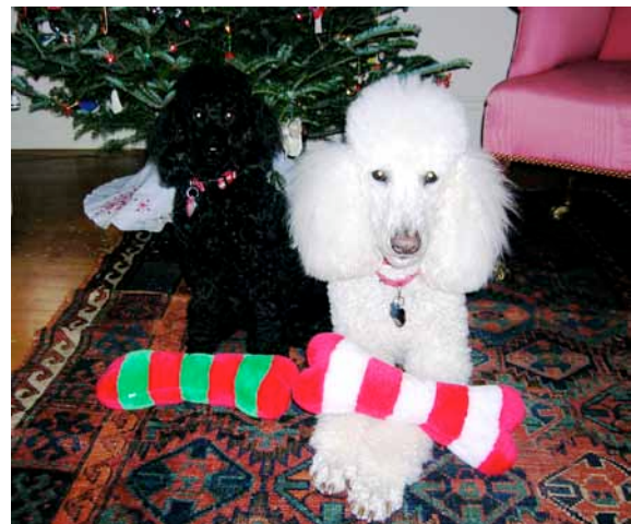
Figaro and Triton