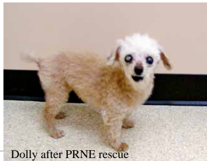
Dolly after PRNE rescue