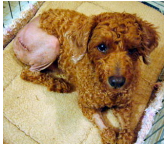
Cooper after surgery