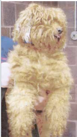
Cooper before surgery