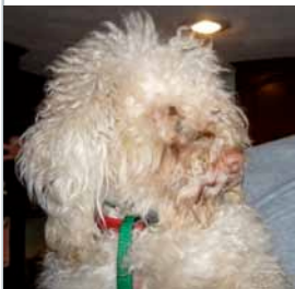
Coco, first day of rescue