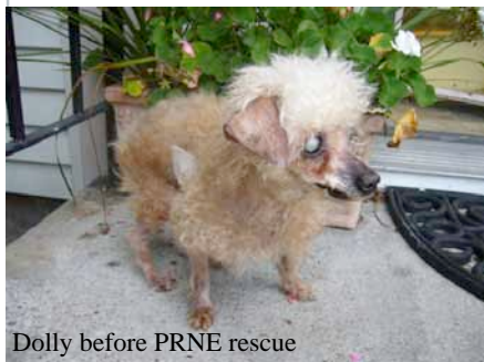
Dolly before PRNE rescue